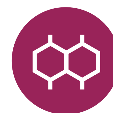
Sulphur dioxide and sulphites